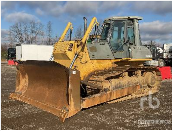
1999 Komatsu D65EX-12 Crawler Dozer