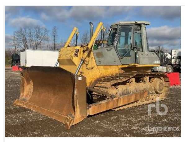
1999 Komatsu D65EX-12 Crawler Dozer