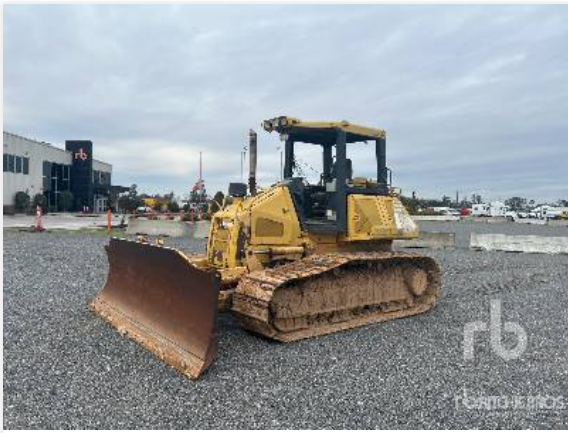
2008 Komatsu D51PX-22 Crawler Dozer