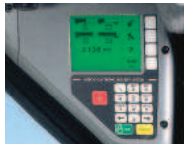
OPTIONAL Deluxe Instrument Panel