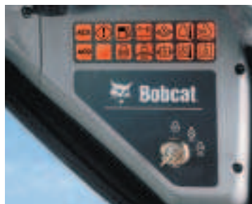
RIGHT Side Standard Instrument Panel