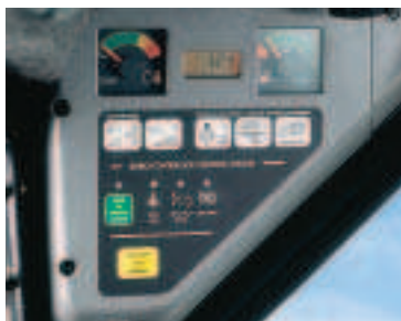
LEFT Side Standard Instrument Panel

State-of-the-art instrument panels provide dozens of operational features, diagnostics and monitoring. Optional deluxe instrument panel includes keyless start security system, feature lockouts, digital time and job clocks, multi-language display, even a "help" menu.