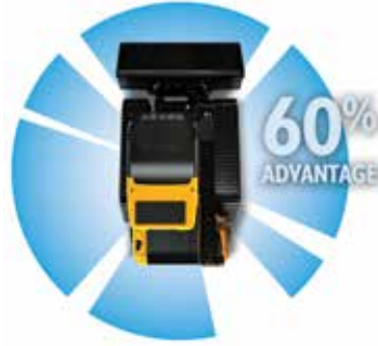
JCB Skid Loader 270° Visibility